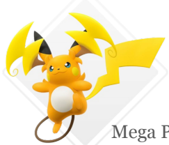
Mega Pikachu X & Y

As Pokémon Legends ZA approaches its release, fans are buzzing with anticipation. Whether it's the promise of new mega evolutions, new typings for fan-favorite Pokémon, or improvements to the battle system, Legends ZA is shaping up to be an exciting new chapter in the Pokémon series. With its release just around the corner, trainers everywhere are eagerly awaiting what the French-inspired region of ZA will bring.