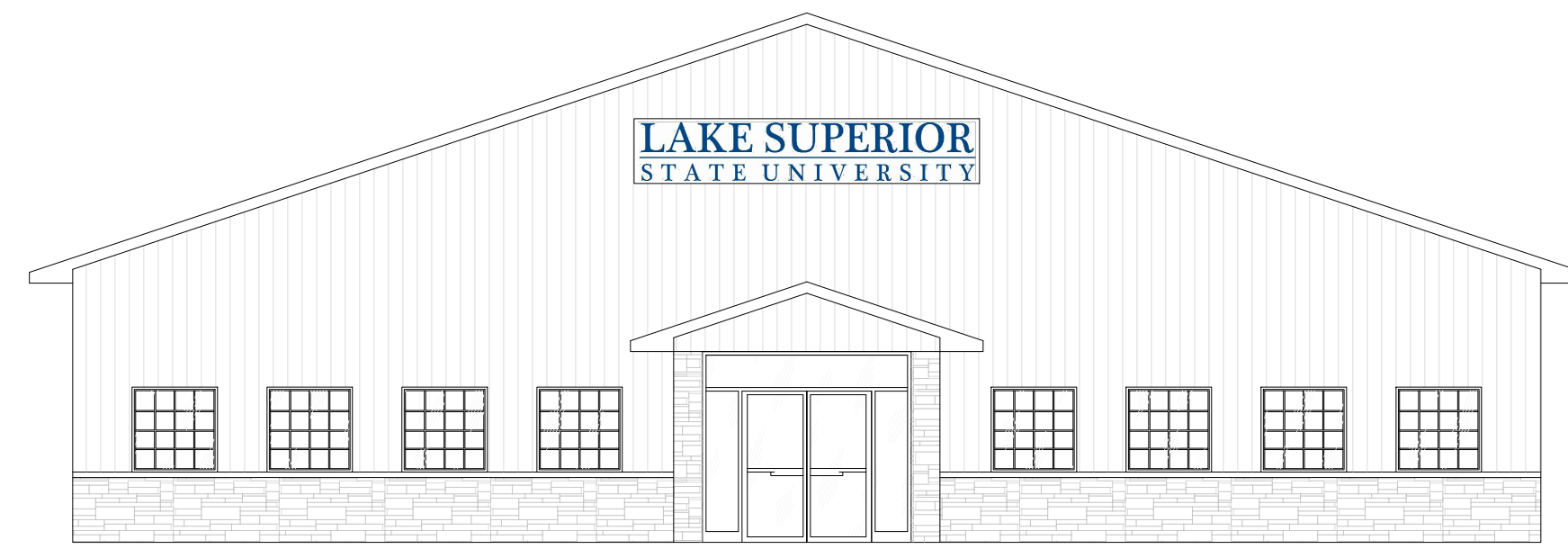
3 West Classroom Building Elevation A-1 SCALE: 1/8" = 1'-0"