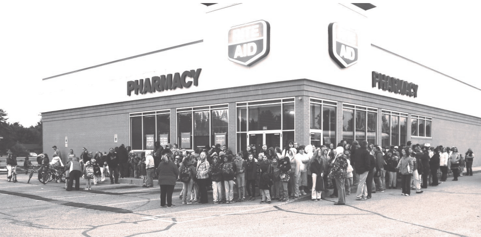
CHA students participated in the National Walk to School day by meeting at Rite Aid and walking to the school.