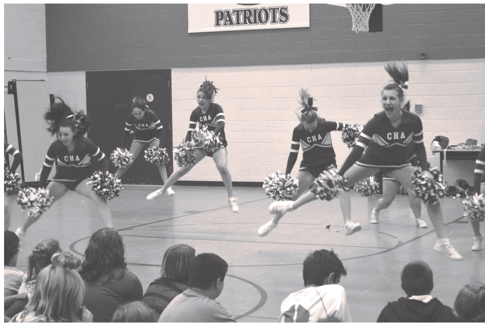
The CHA Cheerleaders fired up the students for Homecoming

The week ended with a pep assembly which included games and activities to raise spirit for the Homecoming football game and dance.