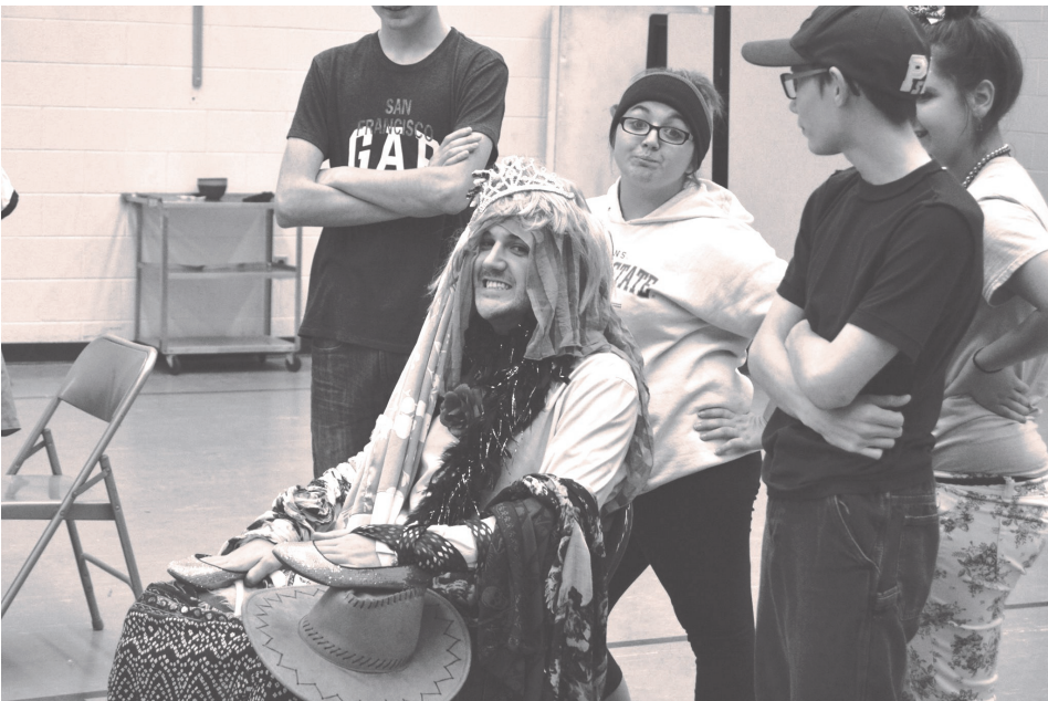
Mr. C is decorated by the students during the Friday pep assembly