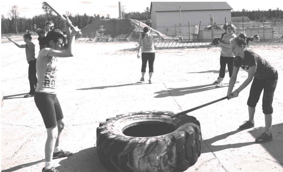
The cheer team conditions outside the workout center