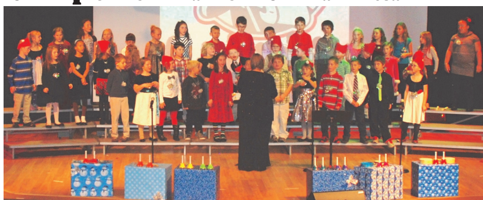
2nd and 3rd graders singing during Christmas Concert