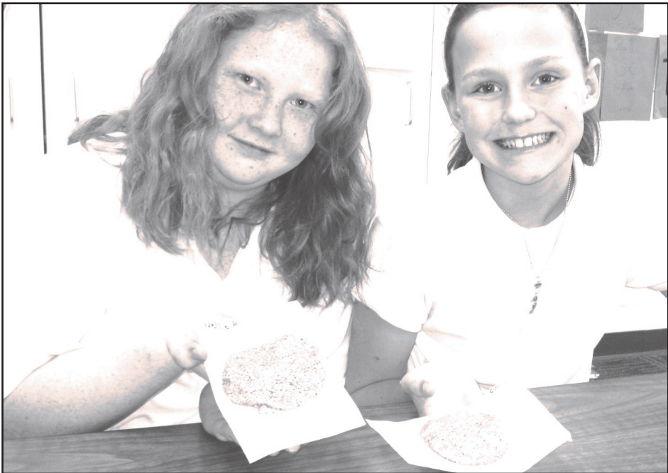
Students show off their fossils

interesting , way better than doing book work." Well that's nice. Fossils have been explored in the 6th grade. For more details go to Ms. Larms room!