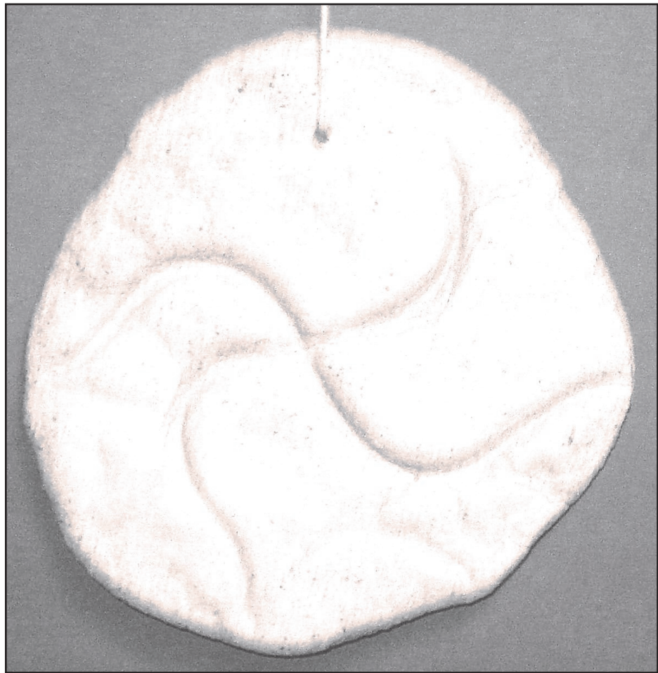
A completed fossil