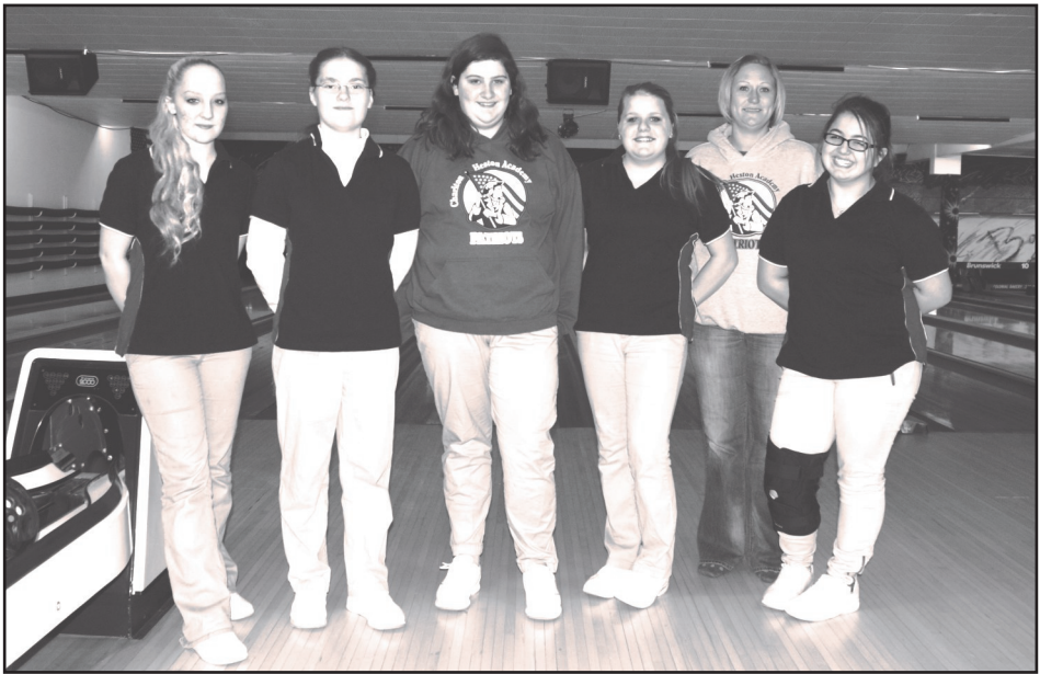
The girl's bowling team