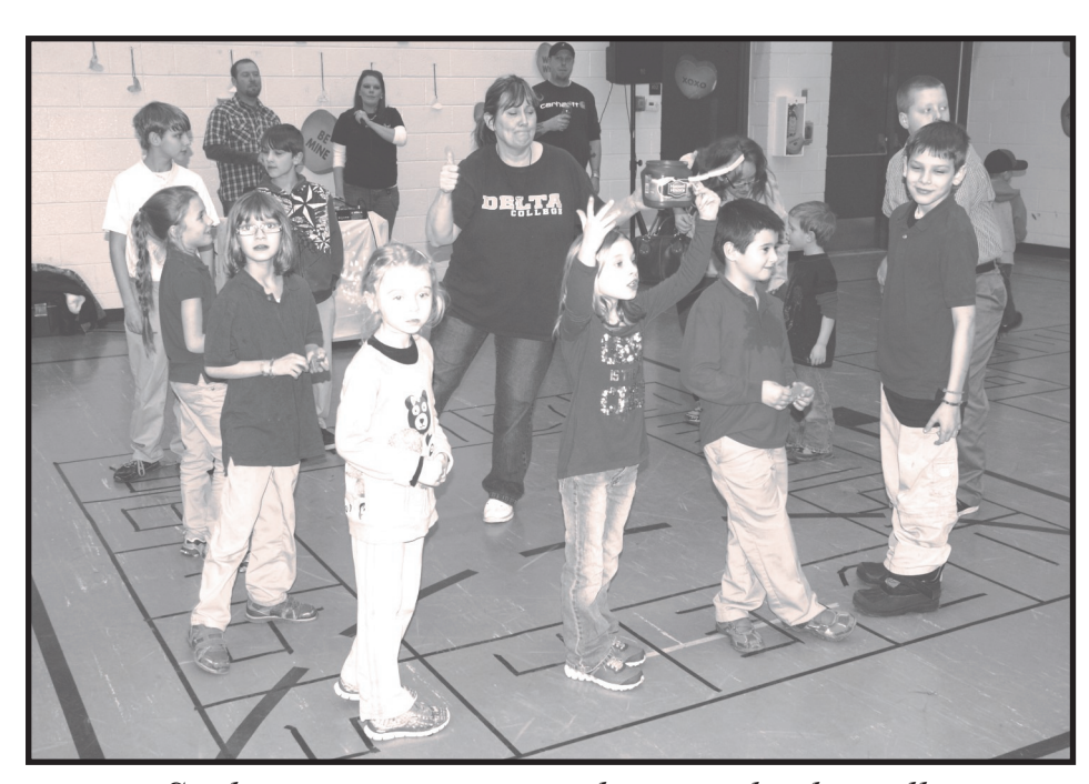
Students participating in the annual cake walk

The Cake walk was a huge success and they raised a big amount of money. A few students from other schools even came.